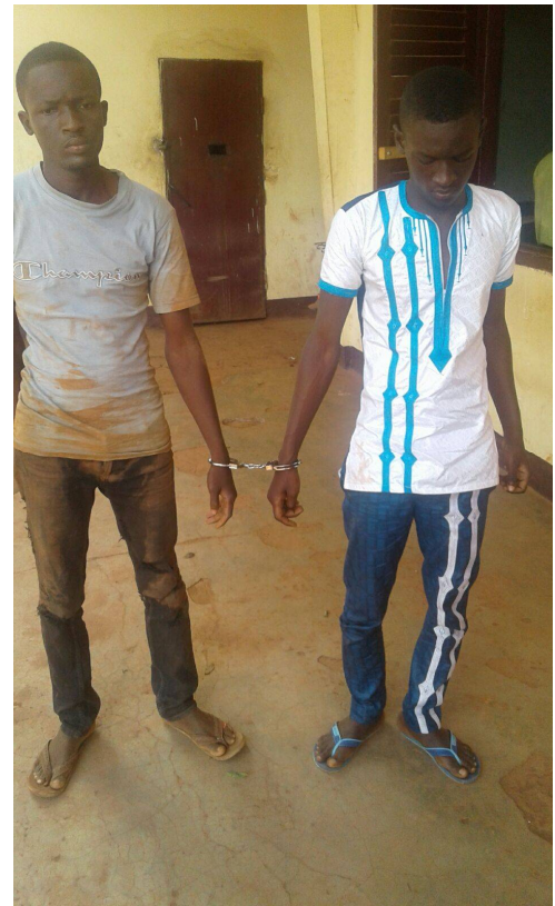
Two traffickers arrested in Bertoua, East for ivory trafficking, they have been in the illegal business for a long time