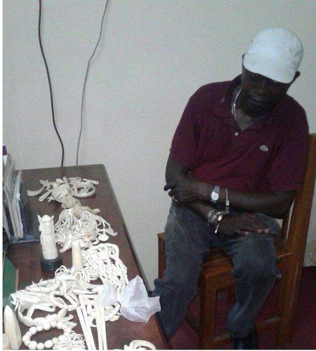
One of two ivory traffickers arrested in Douala at the wildlife office prosecution to begin