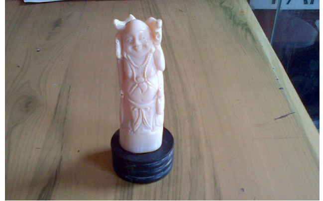
Carved ivory was among several other pieces seized from the traffickers in Douala.