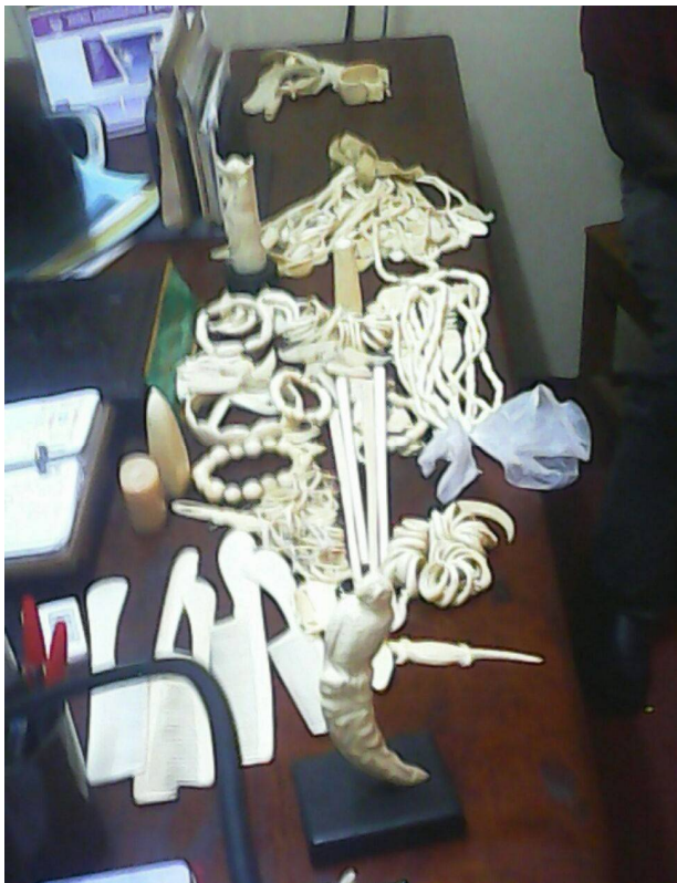
Several ivory jewellery and carved pieces seized from ivory traffickers in Douala