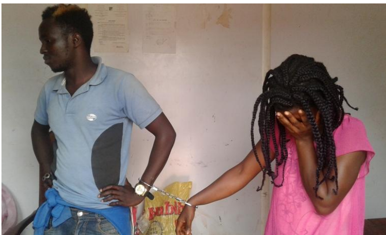
Two arrested traffickers at police station shortly before drafting of writing of complaint reports (above). He awaits prosecutorial process to begin after his arrested with a baby chimpanzee in Djoum (right)