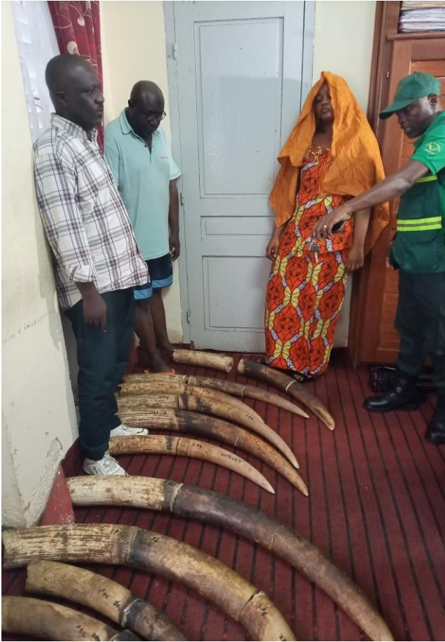
Arrested for trafficking 100kg of ivory, traffickers at wildlife office