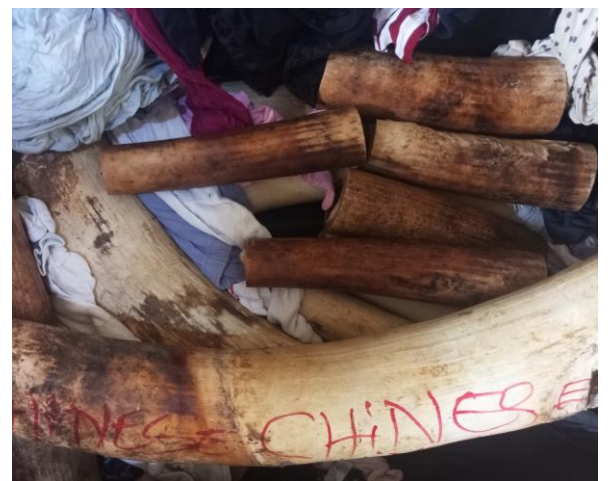
Ivory was concealed in a suitcase