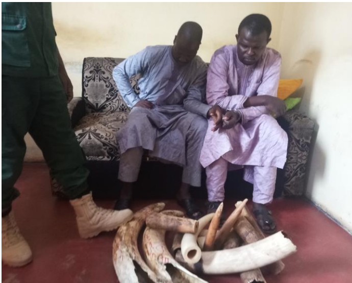
Arrested with 56kg of ivory, traffickers at police station shortly before offense statements are written