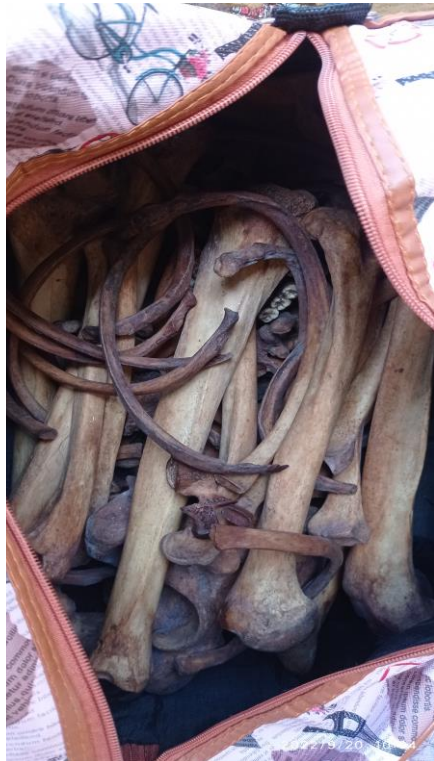
Human bones seized from traffickers in Douala