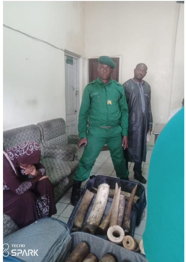
Wildlife official with seized ivory