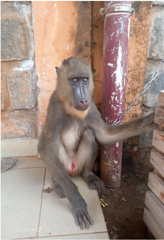
He was rescued from traffickers, at wildlife office